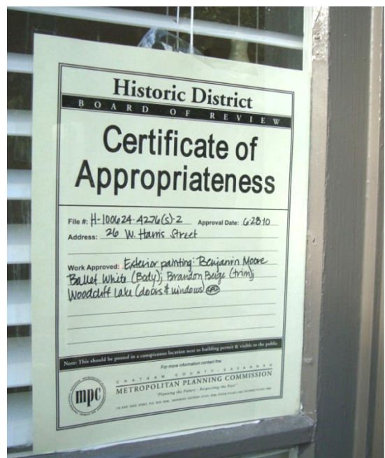
Fig. 1. Certificate of Appropriateness for paint color issued by the Historic District Board of Review, Savannah, GA, 2010.

Several authors emphasize the grassroots, participatory nature of conservation districts, noting